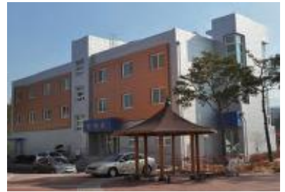
Jeongeup Radiation Research Center Dormitory