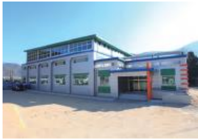
Hongje Middle School Auditorium