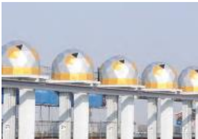
Gimje Intake Station