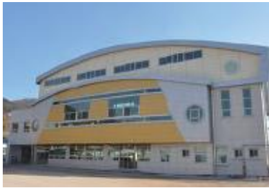
Yangsan Middle School Auditorium