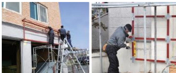
< Welding method >

You can prevent fire which may be caused by welding while installing structures.