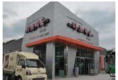
Namwon Mart Town